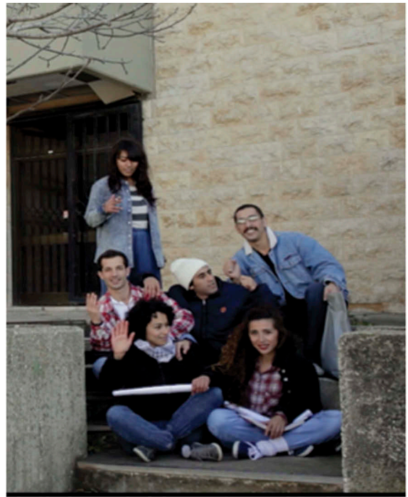
Image 1 On the left Architecture students at Birzeit University in 1991 posing after they broke into their university to take a lecture in the Architecture Department lab. On the right the reenactment and deformation of the picture in the video of C.I.E.

changing the original picture, and emphasizing the absence of women in it. In this way, my archiving practice reflects on the absence of women's important role during the First Intifada in the dominant narrative and reaffirms their actual presence in all civil disobedience acts during that period. C.I.E. re-embodies absent women within a new archival form.