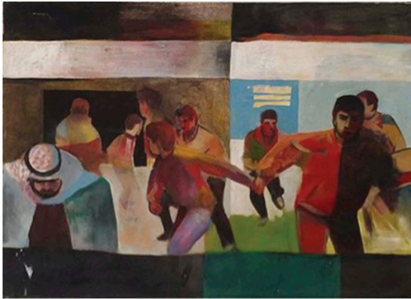
Image 3 Khaled Hourani, a Palestinian visual artist, portrays the intergenerational conflict in his painting From the First Intifada (1987), which was a point of inspiration for one of the video sections.

for international support. In C.I.E I transformed and deformed the postcard by taking out the teacher – the pedagogic figure – and emphasized the instrumentality of the act of taking the picture for propaganda purposes.