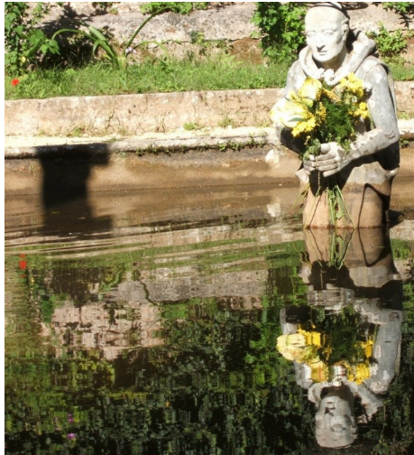
Serra di San Bruno (monastery of the Carthusians) – Calabria, Italy St. Bruno in cold water praying on knees – probably fighting his libido