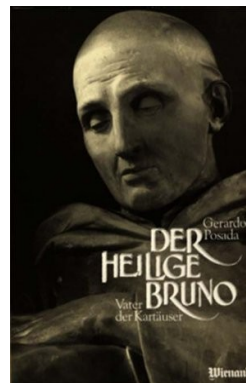
San Bruno (of Cologne), the Carthusian (statue perhaps from France, Grand Chartreuse?) – declared „holy“ nevertheless! Papst Innozenz' XI. is on report saying: „Cartusia numquam reformata, quia numquam deformata“ Such illustrating the power of silence – within a world and multitude of CHATTER!