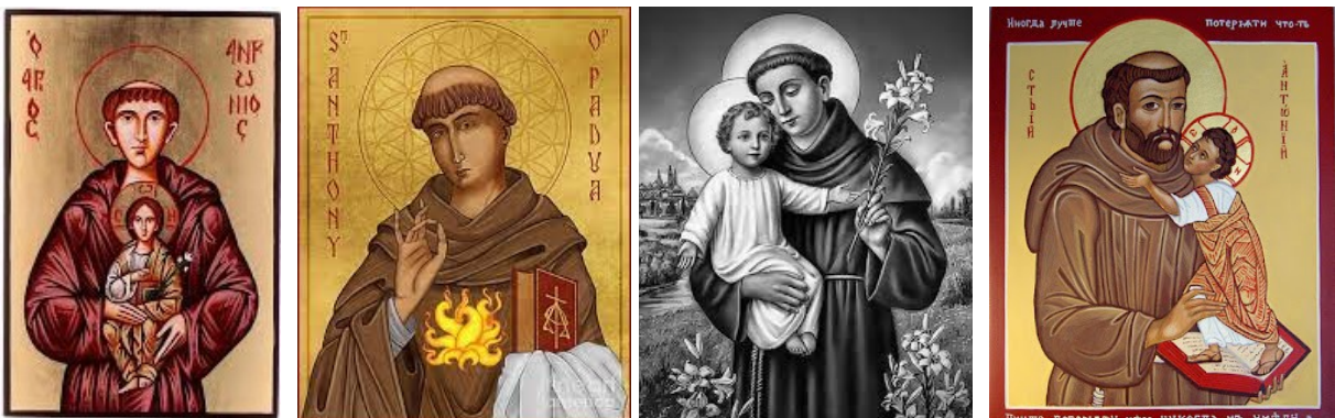
Saint Anthony of Padue – Sant' Antonio di Padova